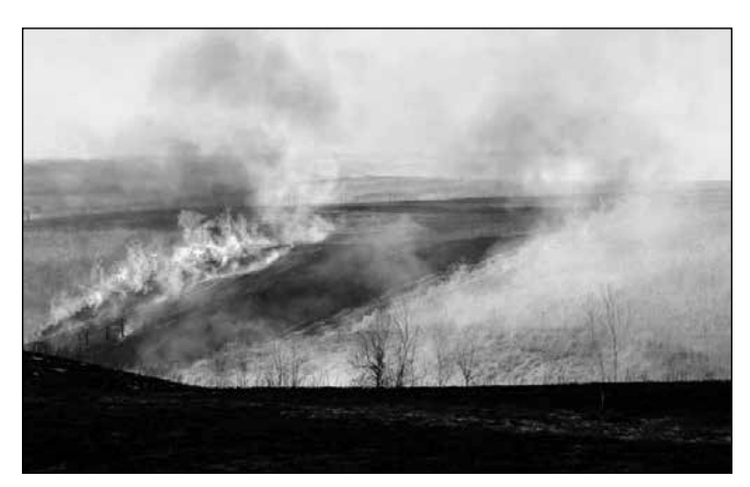
Prescribed burning in the late spring optimizes stocker gains.

After intensive early stocking, stockers are usually placed directly in the feedlot in mid-July. There is a 15 percent increase in feed efficiency for these animals compared to those entering the feedlot in October following season-long stocking. It takes about 1 pound less feed per pound of gain