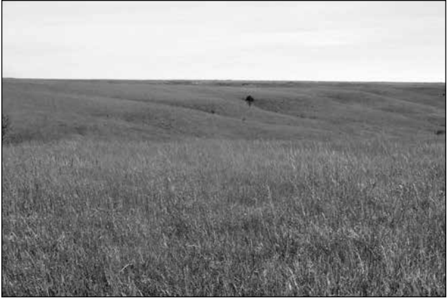
Stocker grazing studies take place at the Rannells Flint Hills Prairie Preserve.

Grazing trials also determined the optimal time to burn for best livestock gains. The results of those studies showed burning bluestem range at the beginning of growth of the native, warm-season, tallgrass species gave the best herbage production, maintained a grass-dominated stand, prevented or reduced woody species invasion, and resulted in the highest livestock gains.