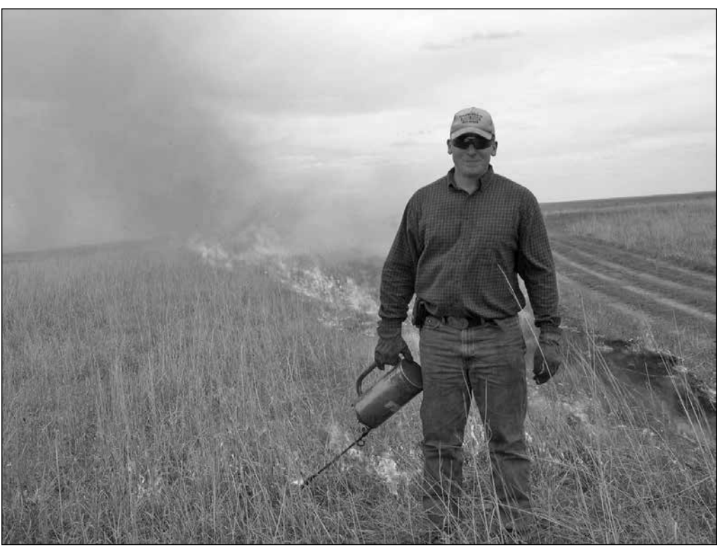
Research shows that prescribed burning is an important tool for preserving Tallgrass Prairie.

for animals placed in the feedlot in July compared to those placed in October. That is largely attributable to cold weather at the end of the feeding period for stockers placed in the feedlot in October.