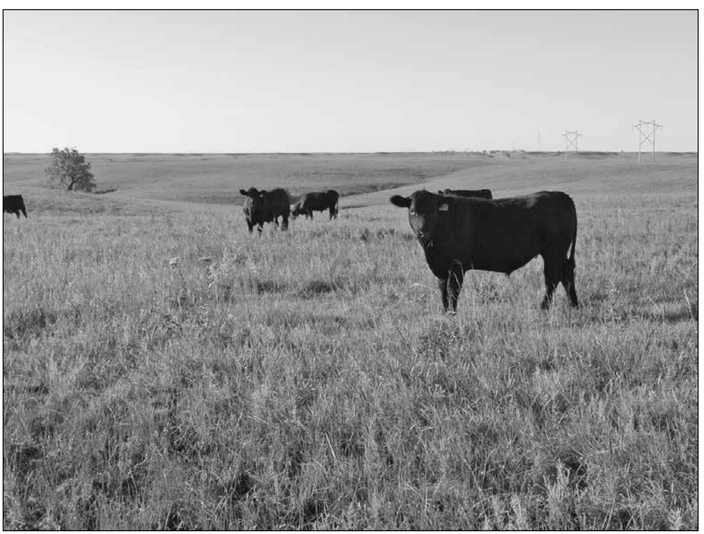
Steers grazing on the Rannells Flint Hills Prairie Preserve.