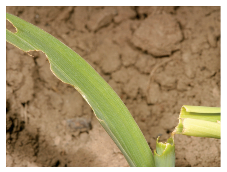
Figure 5. Cutworm damage showing severed stalk of corn