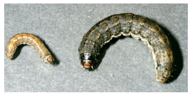
Figure 3. Cutworm larvae

depending on environmental conditions, before pupating. They are often called the "overflow" worm because they seem to thrive in the lower, wetter areas of fields. Pupae are light brown initially, becoming dark mahogany after a few hours (Figure 4).