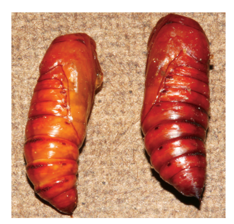
Figure 4. Cutworm pupae

depending on environmental conditions, before pupating. They are often called the "overflow" worm because they seem to thrive in the lower, wetter areas of fields. Pupae are light brown initially, becoming dark mahogany after a few hours (Figure 4).