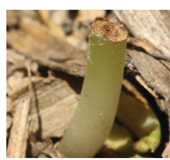
Damage caused by pillbug feeding

they have fed on germinating plants enough to acquire a lethal dose of toxicant. In sufficient numbers, pillbugs may kill seedling plants before consuming enough toxin to kill them. Planting-time insecticide applications have not been effective because these crustaceans do not normally feed in the seed zone where they may be controlled prior to germination.