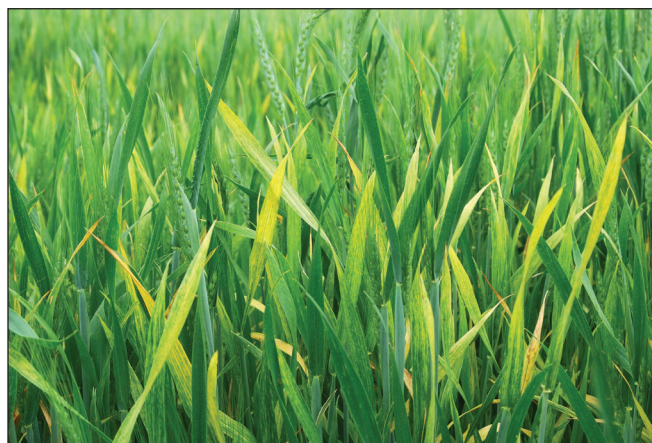
Figure 1. Wheat with symptoms of wheat streak mosaic. Infected plants often have bright yellow discoloration and are often smaller than healthy wheat. The diseased plants also may have a prostrate growth habit.

Wheat streak mosaic is caused by the Wheat streak mosaic virus . The virus is spread by the wheat