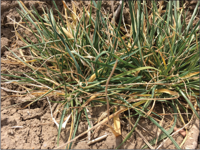
Figure 5. Wheat curl mite-infested leaves take on a rolled appearance, similar to an onion leaf. Leaves can be carefully unrolled to expose the mite colonies. These mites will be about the size of a grain of sand to the naked eye. Note, Russian wheat aphids also roll the leaves, but these will generally show a white striping instead of yellow streaking.