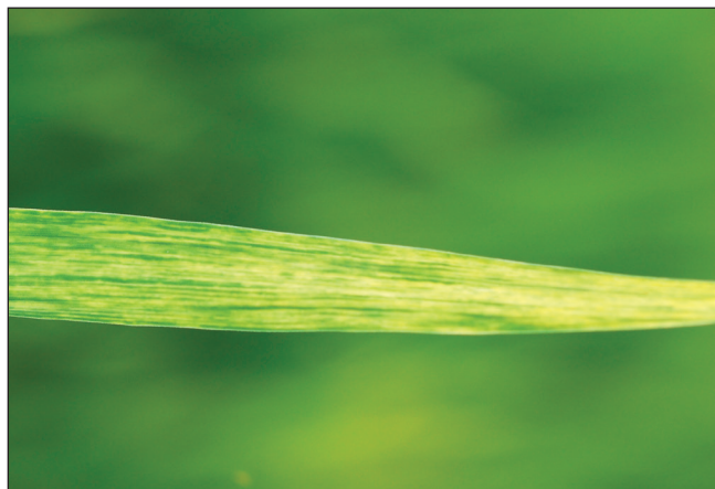
Figure 2. Leaf of a plant infected with wheat streak mosaic. Notice the yellow discoloration is more intense near the leaf tip with streaks extending down toward the base of the leaf.

curl mite, Aceria tosichella , which feeds on wheat and other grasses. The wheat curl mite is tiny and can only be seen with considerable magnification (30–40×). Feeding by mites causes the edge of the affected leaf (Figure 3) to curl back over itself (Figure 4). When populations are high, the leaves may become so