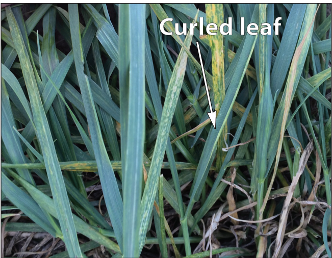
Figure 4. Symptoms of wheat streak mosaic include whitish to yellow streaking, which will usually be more pronounced toward the leaf tip. Note the curled leaf is where a colony of mites live.