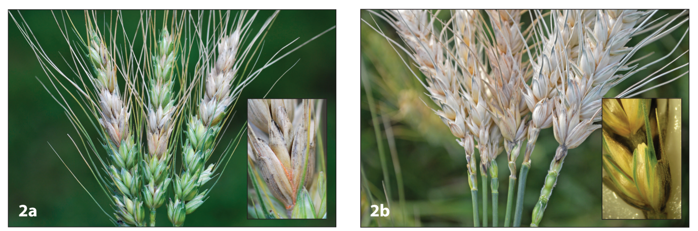
Figure 2. Fusarium head blight (a) produces pink/orange masses of spores, while wheat blast (b) produces dark gray sporulation.

Because no single management method provides high levels of wheat blast control, an integrated disease