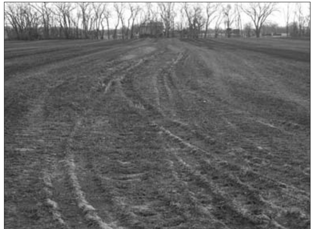
Figure 2. Avoid land application of biosolids when the ground is wet, otherwise, compaction and tracking will occur.

This index considers field parameters such as erosion rate, runoff, level of soil test phosphorus, and phosphorus application rates (from fertilizer and organic sources). Producers should evaluate fields for these parameters and determine the need for soil and water conservation practices,