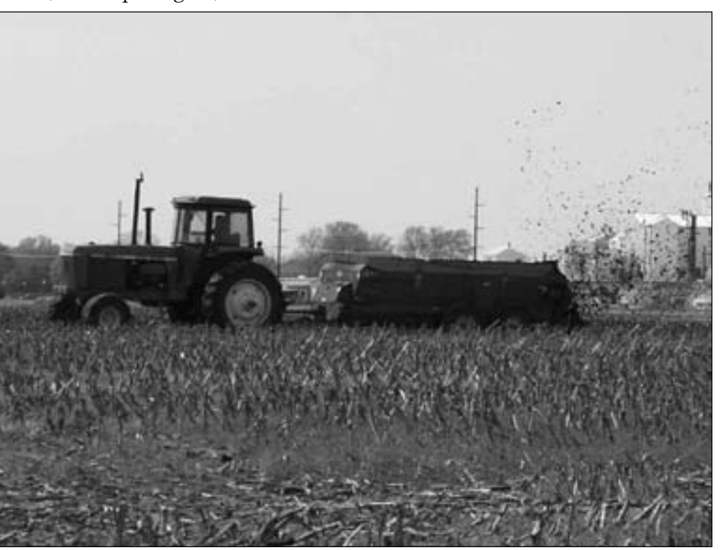
Figure 1. Biosolids applied on cropland provide valuable plant nutrients and conditions the soil.

The term "biosolids," also called "sewage sludge," refers to matter that is separated from wastewater during treatment. Biosolids from onsite wastewater systems such as septic tanks, aerated systems, lagoons, and certain types of portable toilets are collectively referred to as "septage." Biosolids may contain a concentration of