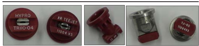
Figure 1. Total Range, Extended Range (left), TurboTeeJet flat-fan (center), TwinJet (right)