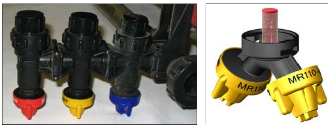
Figure 3. Wilger combination nozzle bank (left) and Twin Cap adapter with MR nozzles.