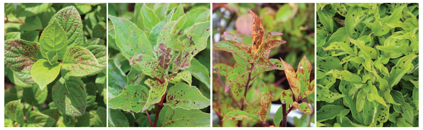
Figure 2. Foliar feeding damage caused by adult redheaded flea beetle. Left to right: Hydrangea spp., Weigela spp., Itea virginica, and Cornus sericea 'Kelseyi'.