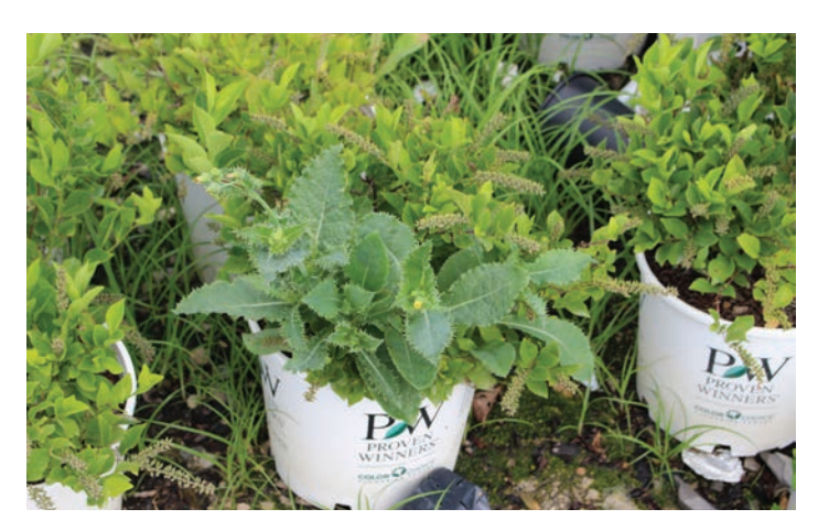
Figure 4. Sowthistle (Sonchus spp.) growing in container.