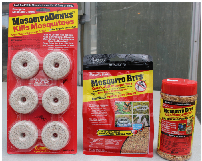
Figure 10. Mosquito dunks (left) and bits (center and right) kill mosquito larvae when applied to water sources (Raymond Cloyd).