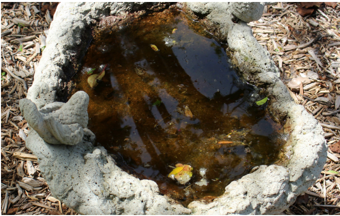
Figure 6. Birdbath filled with water provides a breeding habitat for mosquito larvae (Raymond Cloyd).