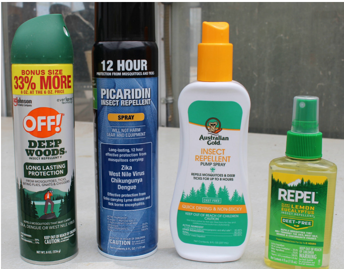
Figure 8. Repellent products that can be applied to the skin to protect against female mosquito bites (Raymond Cloyd).