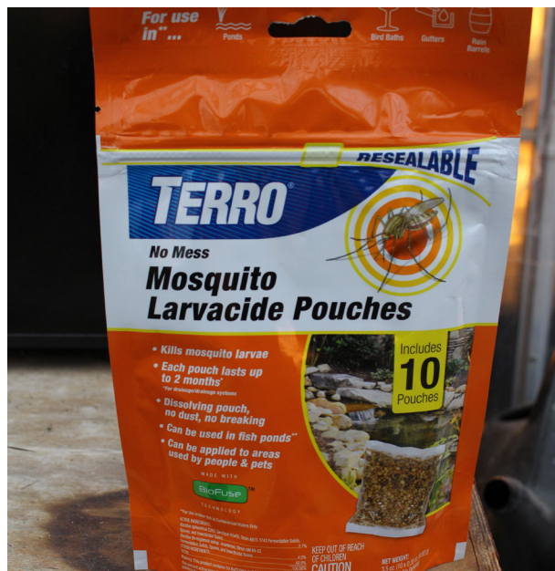
Figure 11. Larvicidal product containing two active ingredients, Bti and Bs (Raymond Cloyd).