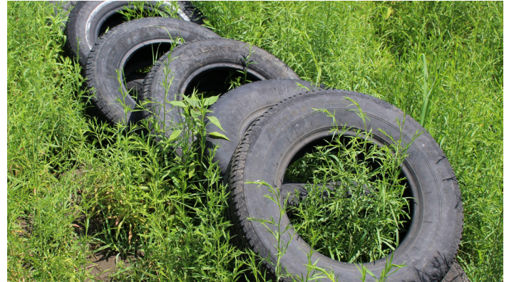
Figure 5. Old or used tires filled with water provide a breeding habitat for mosquito larvae.