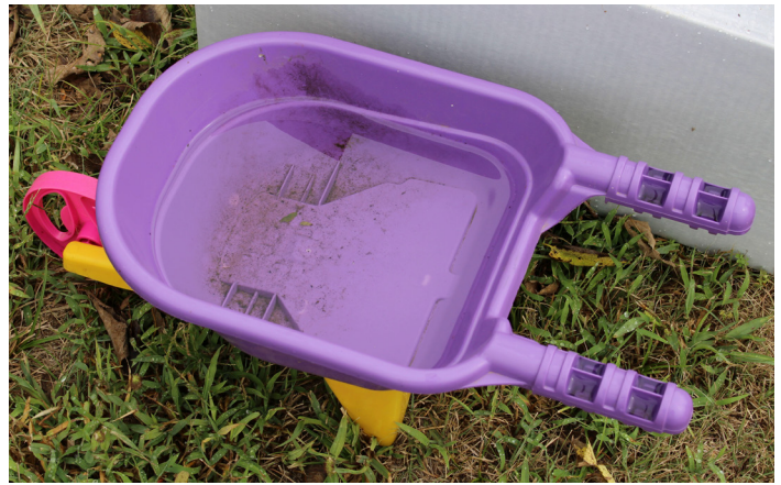
Figure 7. Children's toys that collect water serve as a breeding habitat for mosquito larvae (Raymond Cloyd).