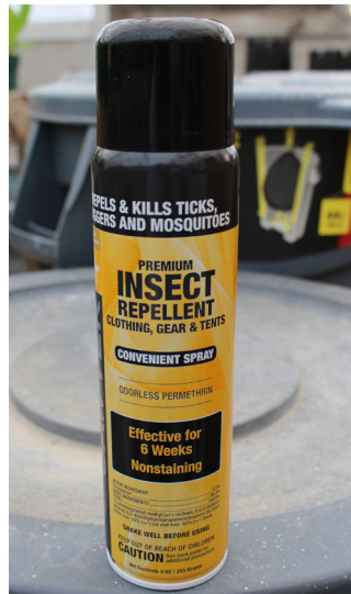
Figure 9. Repellent that contains permethrin as the active ingredient (Raymond Cloyd).

Always follow directions on the product label when using repellents.