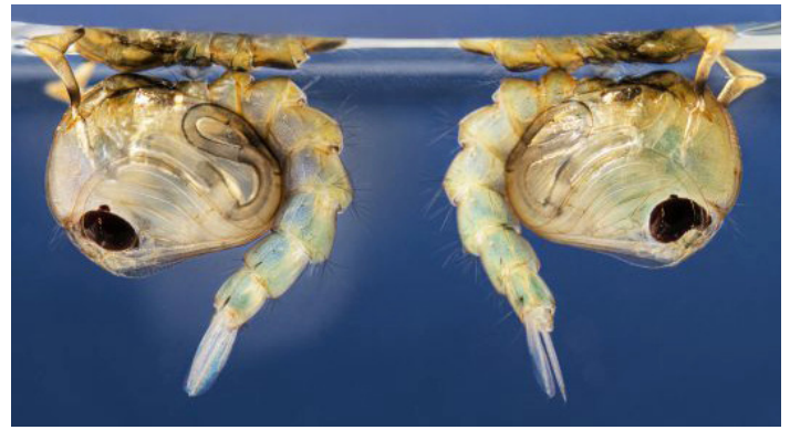
Figure 4. Mosquito pupae located below the water surface (Ask A Biologist).

Eliminate breeding habitats where mosquito larvae can develop by removing stagnant or standing water from items or areas that collect water such as those listed in Table 2. Removing water sources where mosquitoes breed reduces subsequent adult mosquito populations. Replace the water in birdbaths once a week to remove mosquito larvae that may be present in the water.