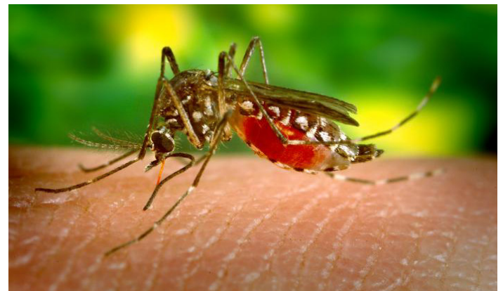
Figure 2. Adult female mosquito withdrawing blood from a host.

Female mosquitoes can sense heat and carbon dioxide emitted from the breath and skin of humans and animals. Females can also sense certain odors, carboxylic acid, lactic acid (sweat), and human and animal movement. Mosquitoes are attracted to dark colors and some humans more than others because of differences in body odors. When a female mosquito bites, she injects saliva that acts as an anticoagulant, which prevents the blood from clotting. The injected saliva contains agents that increase blood flow, thus enabling the female to withdraw blood. In addition, the injected saliva triggers the body's immune system to release histamine, an organic compound that causes swelling and itching. Adult female biting activity varies by species. Aedes spp. females are active in the morning and evening, and Culex spp. females are active just before sunset and daybreak.