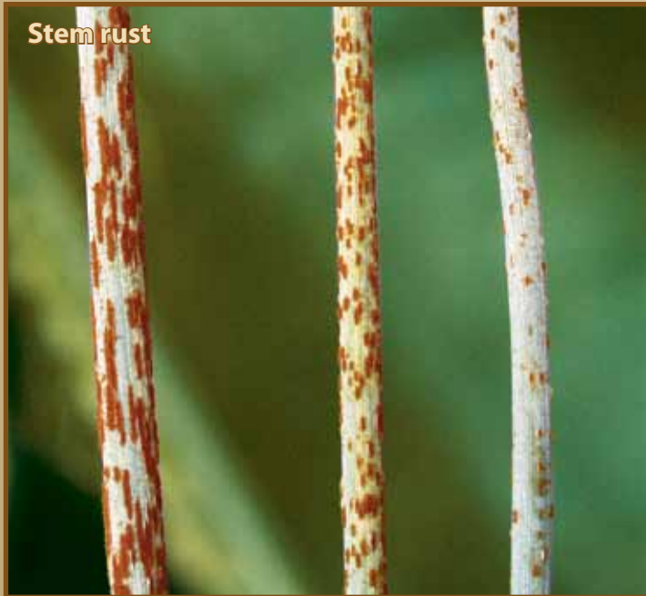
Figure 3. Examples of the variability in symptoms caused by stem rust (below), leaf rust (upper right) and stripe rust (lower right) as a result of unique interactions with wheat or barley varieties.

All three diseases have unique interactions with common varieties of wheat and barley. These interactions can modify the disease symptoms resulting in reduced lesion size and varying amounts of yellow or tan tissue surrounding the lesions (Figure 3). Becoming familiar with the range of possible symptoms for these diseases will improve the accuracy of the diagnosis and the management of these economically important diseases.