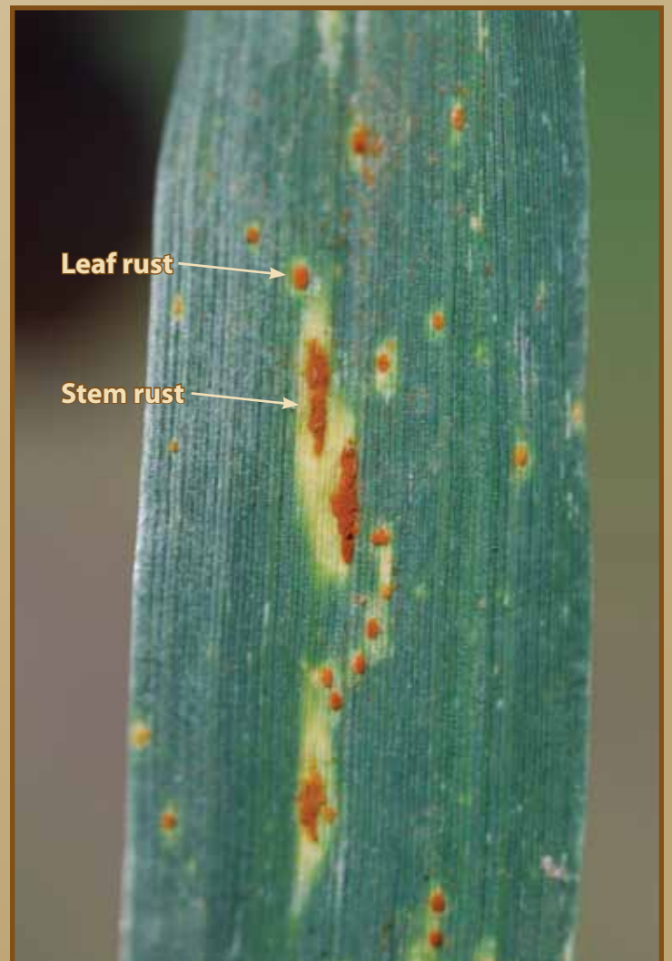
Figure 2. Comparison of the stem rust and leaf rust lesions on leaf tissue. Note the larger diamond shape of the stem rust relative to leaf rust.

Differentiating the rust diseases can be difficult, but with practice they can be reliably identified. Begin by considering broad characteristics such as which plant parts are affected (Figure 1) or arrangement of the blister-like lesions on plants. These characteristics will often separate one or more of these diseases quickly. Continue by examining less obvious characteristics including lesion size, shape, and color to either confirm the diagnosis or separate the more similar diseases. For example, stripe rust is the only one of these diseases to have the blister-like lesions organized into stripes on the leaves (left). If the lesions are scattered on the affected plant parts, both stem rust and leaf rust are a possibility and additional characteristics must be considered. Leaf rust typically causes small, round lesions on the leaf blades and leaf sheaths. In comparison, stem rust causes oval or elongated lesions and is capable of infecting nearly all aboveground parts of the plant, most notably the true stems (Figure 2).