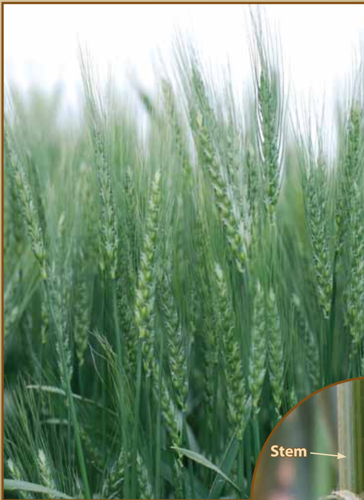
Figure 1. The diagnosis of rust diseases requires some basic understanding of plant anatomy and a quick review of this information may improve the accuracy of the identification process.

depends on host susceptibility and weather conditions, but the loss also is influenced by the timing and severity of disease outbreaks relative to crop growth stage. The greatest yield losses occur when one or more of these diseases occur before the heading stage of development. Early detection and proper identification are critical to in-season disease management and future variety selection.