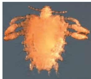
Figure 2. Human pubic lice

The female louse lays four to six eggs (nits) (Figures 3 and 4) per day, usually at night – 50 to 150 eggs in her lifetime. Each egg is attached to an individual hair between \frac{1}{16} and \frac{1}{8} inch from the scalp, with a