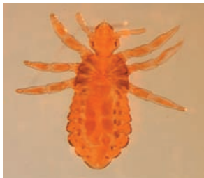
Figure 1. Human head lice

People can be infested with three types of human lice: head lice, body lice, and pubic (crab) lice (Figures 1 and 2). New evidence based on DNA analysis shows