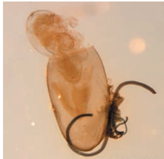
Figure 3. Head lice nit

Body lice are morphologically identical to head lice, but they are usually 10 percent to 20 percent larger, \frac{1}{11} to \frac{1}{8} inch (2.3 to 4.2 mm) long. Body lice are generally associated with unclean environments, inadequate bathing, clothes sharing, and crowded conditions. Body lice are currently rare in the United States except possibly among “colonies” of homeless people or in crowded shelters.