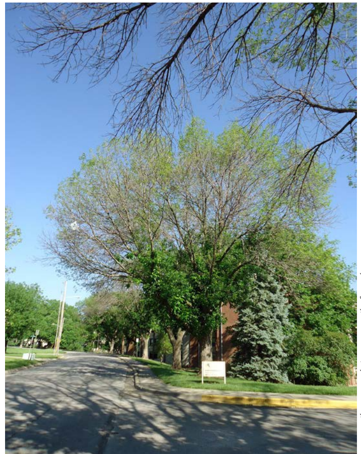
Figure 7. Irreversible damage in the tree canopy.

The best candidates for preventive treatments are trees that appear healthy and do not show signs of borer activity such as a thin canopy, dying branches, water sprout growth, bark splits, D-shaped beetle emergence holes and woodpecker damage. Unfortunately, these abnormalities become evident only after several years of feeding by emerald ash borer larvae. Trees showing these signs of irreversible damage are less likely to be saved.