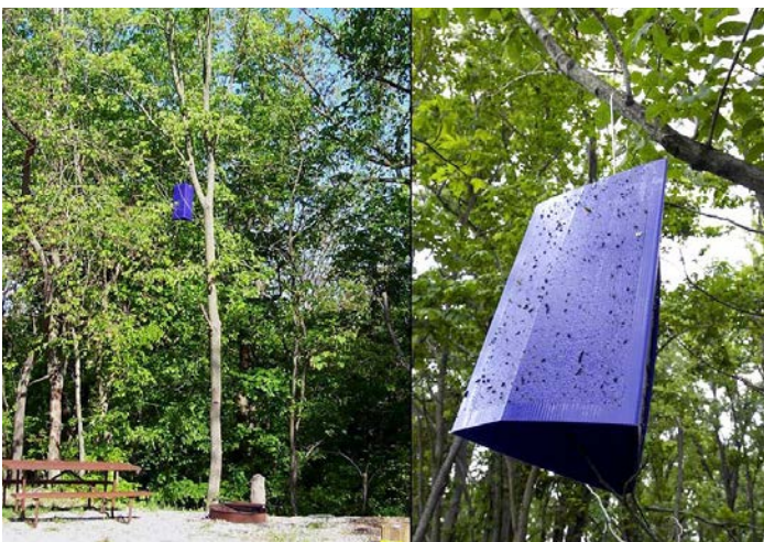
Collin Wamsley, Missouri Department of Agriculture

Since 2008, USDA's Plant Protection and Quarantine program and KDA have been participating in a national trapping survey, deploying sticky purple prism traps baited with attractive aromatic lures at detection points in Kansas such as rest areas, nurseries, camping sites, pallet remanufacturers, raceways, forest debris sites, sawmills, and military bases. No emerald ash borers were recovered between 2008 and 2012. In 2013, five beetles were found at four trap sites near the same location: one beetle at site A, two beetles at Site B, and one each at sites C and D.