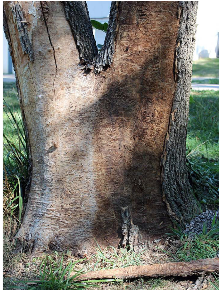
Figure 1. Emerald ash borer infestation.

Early national media reports of EAB activities raised little concern in Kansas, mainly because of the vast geographic buffer separating the state from the waterways where the pest was first established. In 2008, EAB was confirmed at Lake Wappapello State Park in southeast Missouri, only 237 miles from the Kansas town of Galena, which prompted federal and state agencies to monitor for EAB in Kansas. With no detections further west for several years, Kansans remained relatively complacent until July 2012 when authorities announced the discovery of EAB in Parkville, Missouri, which borders Wyandotte County. Based on damage to the infested tree, it was estimated that EAB had been present for 6 to 8 years.