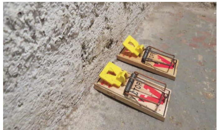
Trap placement for effective control.

Locate traps behind objects, in dark corners, and other areas where there are signs of mice activity. Place traps next to walls so mice pass directly over the trigger (below). Set traps on ledges and pallets in warehouses and buildings mice visit. Use enough traps to make the effort quick and decisive. Mice seldom venture far from food and shelter, so traps should be placed no more than 6-8 feet apart. As an alternative, glue boards can be placed along walls and pathways to catch and hold mice that try to cross. Do not place glue boards where