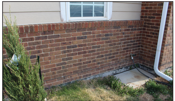
Figure 4. Apply pesticides to the foundation up to the bottom of windows (Raymond Cloyd)

Raymond A. Cloyd Horticultural Entomology and Plant Protection Specialist