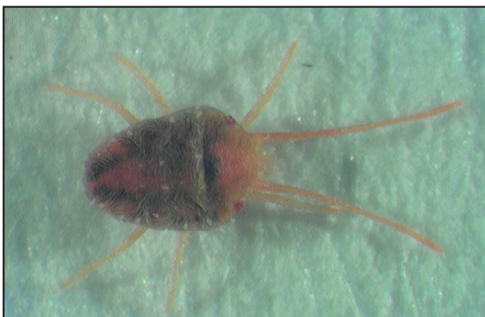
Figure 1. Clover mite adult with front legs protruding forward (Raymond Cloyd)