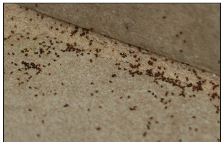
Figure 2. Clover mites inside the corner of a building (Raymond Cloyd)