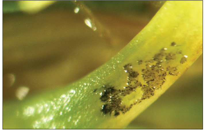
Figure 2. Black spore-producing structures (acervuli) on green tissue.