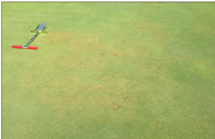
Figure 1. Anthracnose causes a yellow discoloration.

Basal crown rot occurs when the anthracnose fungus infects the crown. Plants with basal crown rot are killed, resulting in a thinning of the turfgrass. Acervuli and small, black fungal resting structures are visible with a hand lens (Figure 4).