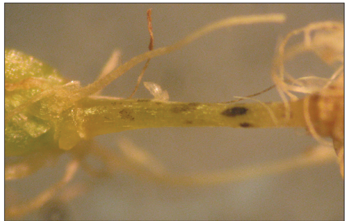
Figure 4. Black fungal growth is visible on the crown in the basal rot phase of anthracnose.