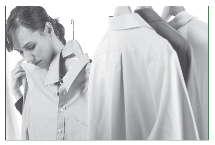
Regularly evaluate your wardrobe.