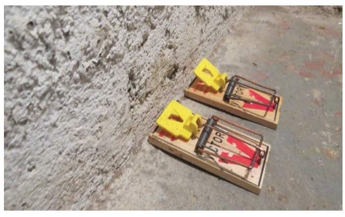
Trap placement for effective control.

Locate traps behind objects, in dark corners, and other areas where there are signs of mice activity. Place traps next to walls so mice pass directly over the trigger (below). Set traps on ledges and pallets in warehouses and buildings mice visit. Use enough traps to make the effort quick and decisive. Mice seldom venture far from food and shelter, so traps should be placed no more than 6-8 feet apart. As an alternative, glue boards can be placed along walls and pathways to catch and hold mice that try to cross. Do not place glue boards where