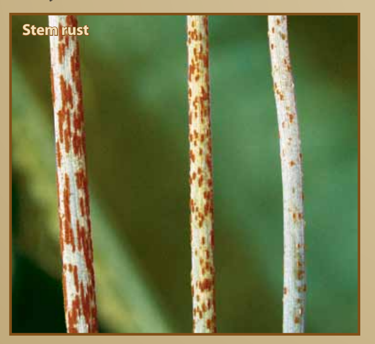
Figure 3. Examples of the variability in symptoms caused by stem rust (below), leaf rust (upper right) and stripe rust (lower right) as a result of unique interactions with wheat or barley varieties.

All three diseases have unique interactions with common varieties of wheat and barley. These interactions can modify the disease symptoms resulting in reduced lesion size and varying amounts of yellow or tan tissue surrounding the lesions (Figure 3). Becoming familiar with the range of possible symptoms for these diseases will improve the accuracy of the diagnosis and the management of these economically important diseases.