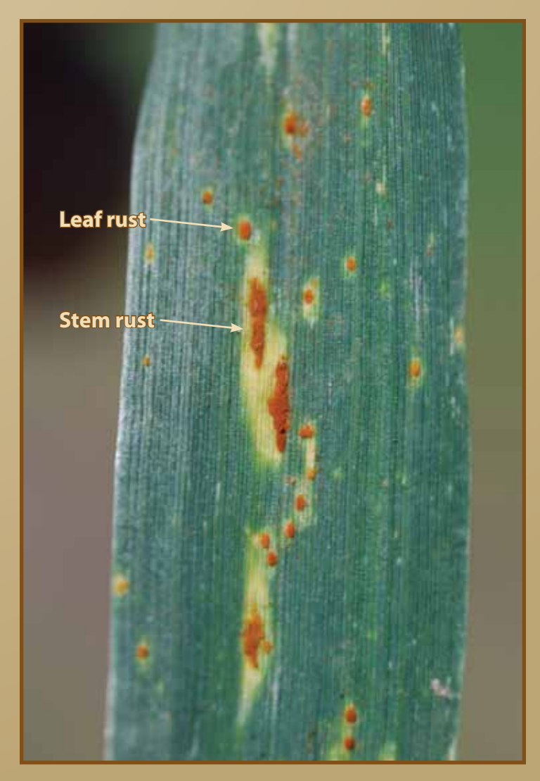
Figure 2. Comparison of the stem rust and leaf rust lesions on leaf tissue. Note the larger diamond shape of the stem rust relative to leaf rust.

Differentiating the rust diseases can be difficult, but with practice they can be reliably identified. Begin by considering broad characteristics such as which plant parts are affected (Figure 1) or arrangement of the blister-like lesions on plants. These characteristics will often separate one or more of these diseases quickly. Continue by examining less obvious characteristics including lesion size, shape, and color to either confirm the diagnosis or separate the more similar diseases. For example, stripe rust is the only one of these diseases to have the blisterlike lesions organized into stripes on the leaves (left). If the lesions are scattered on the affected plant parts, both stem rust and leaf rust are a possibility and additional characteristics must be considered. Leaf rust typically causes small, round lesions on the leaf blades and leaf sheaths. In comparison, stem rust causes oval or elongated lesions and is capable of infecting nearly all aboveground parts of the plant, most notably the true stems (Figure 2).