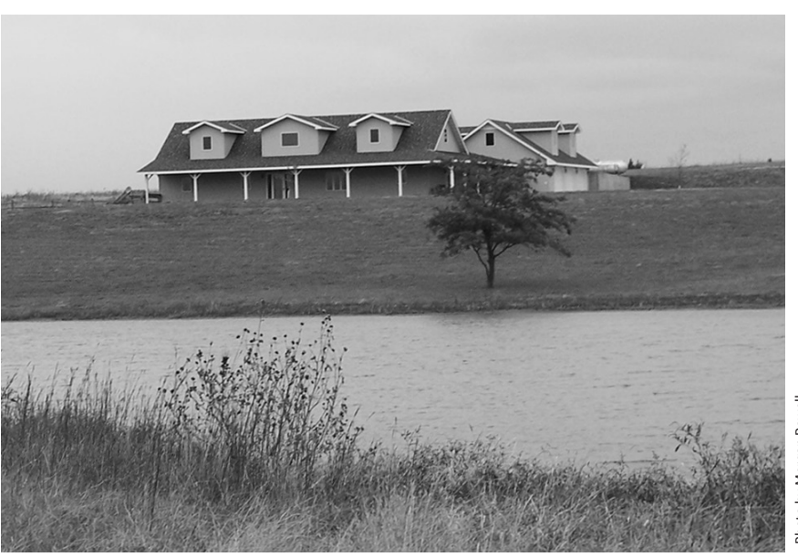
A central Kansas rural home.

Kansas has no statutory requirement for a seller to disclose. To avoid having a home sell while investigations are pending, make an offer and sign a contract contingent on home inspection and meeting certain standards.