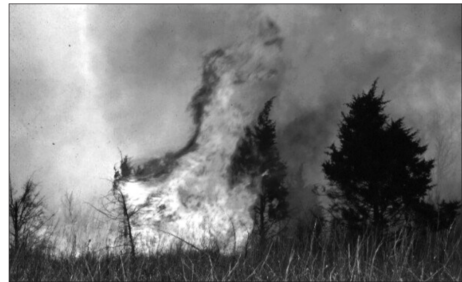
A cedar tree goes up like a torch.

To avoid a wet basement or other problems, check for springs and seeps on the property, especially when the site includes sloping hill-sides. A line of shrubs on a hillside may indicate an active or intermittent spring. Springs are often active after an extended wet period or heavy rain. Keep water out of a new or existing house and remove groundwater with footing drains and a sump pump. A power outage during a storm will inactivate the sump pump. Be aware that light pollution exists even in the most rural areas. Depending on separation distance, it may be mildly or extremely annoying. Light sources continue to increase and include cities, towers, industry, houses, and farms.