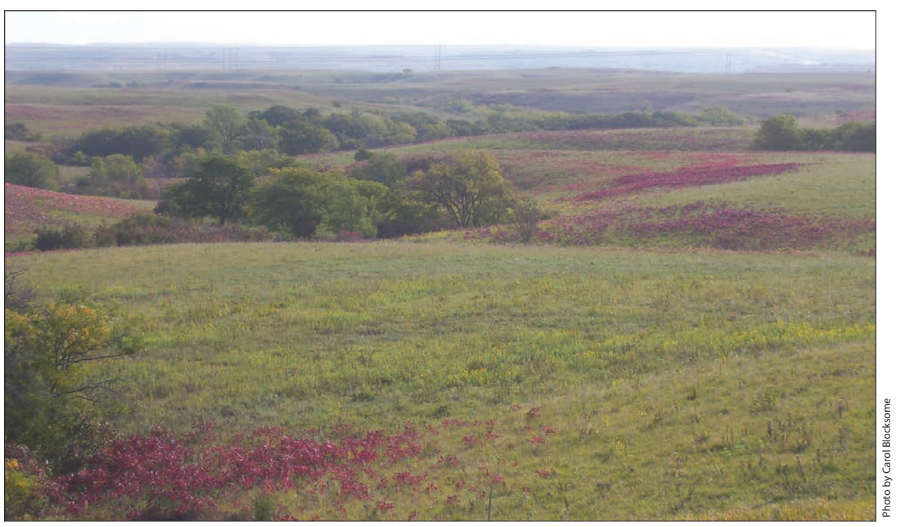
Scenic vistas, such as these sumac-colored hills in Riley County, are one of the attractions of country life.

This primer is designed to help prospective buyers make informed decisions about purchasing a home or home site in rural Kansas. It can also be a resource or reference for those new to country living. The local K-State Research and Extension office is also an important local resource for more information about topics related to living in the country. Extension agents can answer questions, provide referrals to specialists, and recommend extension publications for more in-depth information. Most extension publications are also available online at www.bookstore.ksre.ksu.edu.