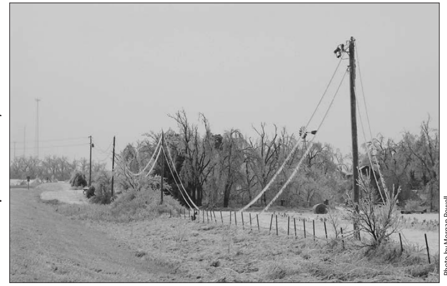
Downed power lines near Riley, Kan., after an ice storm.

mended because of fire and environmental hazards from burning metals, plastics, and other man-made materials. Call the fire department for a burn permit and notify the fire department or the sheriff every time burning occurs. When trash is burned, understand that the owner is responsible if the fire spreads. During drought periods, burning may be banned, and the landowner will have to store trash or have an alternative plan.