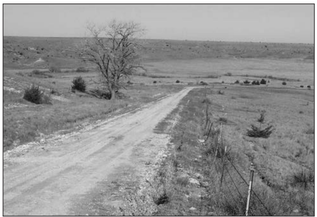
Roads in rural Kansas can range from smooth, well-marked two-lane highways (left) to gravel county roads (center) to dirt tracks (right). Road conditions depend on weather and maintenance. A gravel or dirt road that is easily passable in dry weather can become hazardous after a little rain, snow, or ice. Even paved roads deteriorate after winter's freezing, thawing, and salt treatment.

county offices; the local health department; mental health services; cemetery and library districts; and services for the elderly.