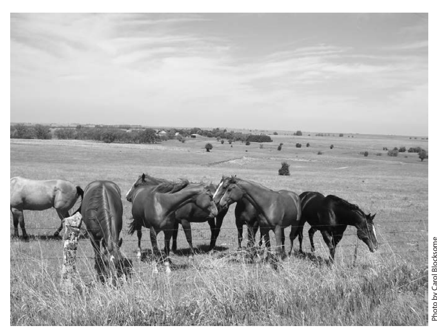
Horses graze in an Ellsworth County pasture.

Some pet owners decide they don't want a pet