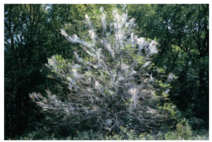
Figure 19. Extensive webbing