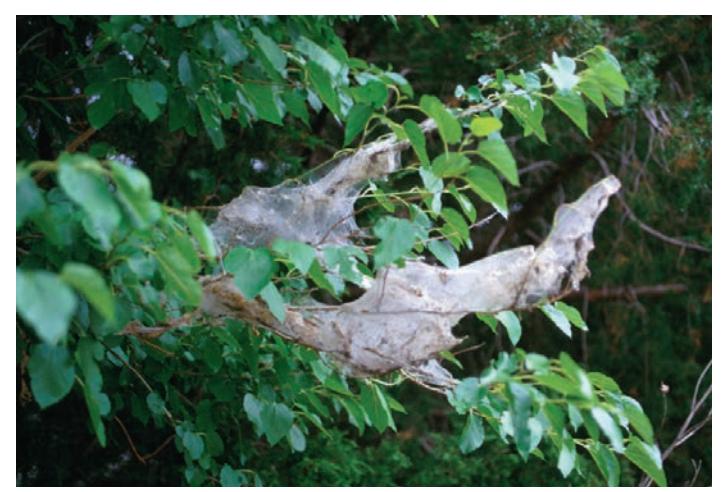
Figure 18. Minimal webbing