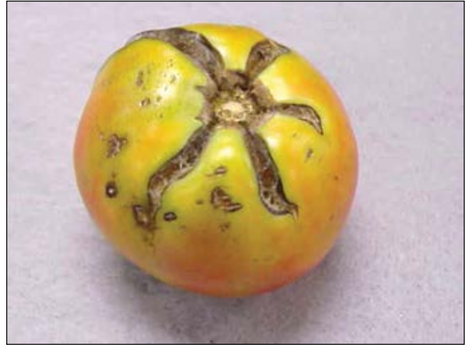
Figure 11. Radial growth cracks.

Select cultivars less prone to cracking. Provide even water and balanced nutrition to avoid overly lush growth. Limit fruit exposure to sun through proper staking or trellising, and by managing foliar diseases.