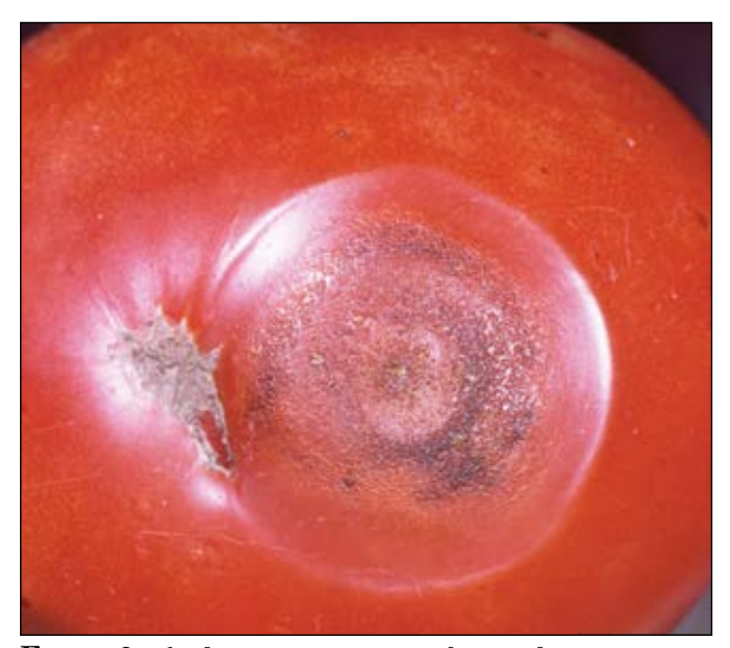
Figure 3. Anthracnose causes circular, sunken areas on ripening fruit which later support numerous fungal spore-producing structures (black specks).

Homeowners can refer to Table 1. Commercial growers should consult the Midwest Vegetable Production Guide for Commercial Growers ; a management guide published every year. Contact your local K-State Research and Extension Office or the K-State Plant Diagnostic Lab for ordering information.