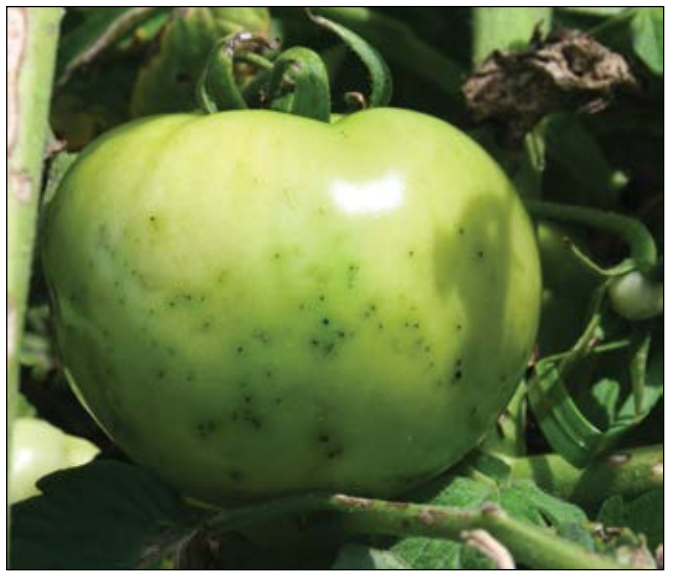
Figure 4. Bacterial speck causes tiny black lesions on fruit.

Bacterial canker, a third bacterial disease, can be a serious problem in commercial and small garden tomato plantings. This disease can cause lesions or cankers on any portion of the plant, including the fruit, or it can result in a general wilt or decline of the plant. Diseased tomatoes first exhibit yellowing and wilting of leaves on a portion of