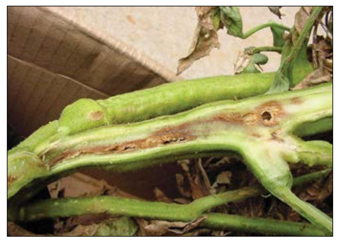
Figure 6. Bacterial canker can cause a rotting in the stem, visible as discoloration when the stem is cut.

The bacterium can be introduced into fields on contaminated seed or on infected transplants. The bacterium also can survive in soil on infested plant material for at least 1 year. During the growing season, the small bacteria are dispersed by water (irrigation or rain) and infect plants through wounds or natural openings. Once inside the plant, the organism can invade the water-conducting tissue and be carried systemically throughout the plant.