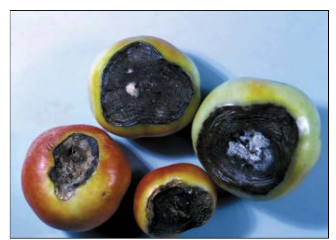
Figure 8. Blossom end rot causes sunken, water soaked lesions that eventually turn black.

Growth cracking occurs on tomato fruit that expand too quickly. It is most common on nearly ripe fruit, but it can occur on younger fruit. Cracks develop in concentric circles around the stem scar (Figure 10). They also can