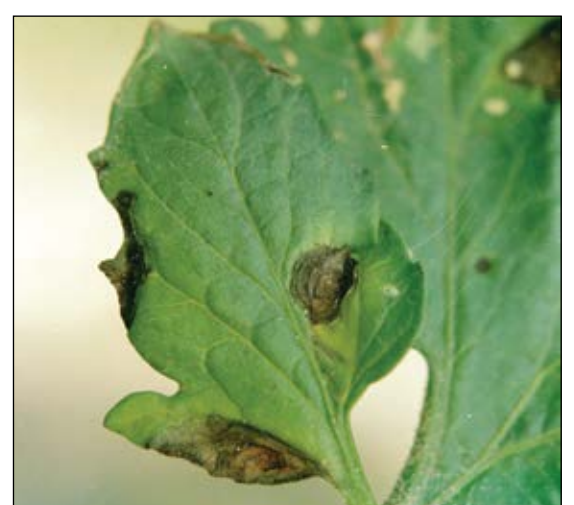
Figure 2. Early blight lesions on tomato leaves usually have a target-like appearance.

blight is the formation of dark, concentric rings within the lesion, giving the spots a targetlike appearance (Figure 2).