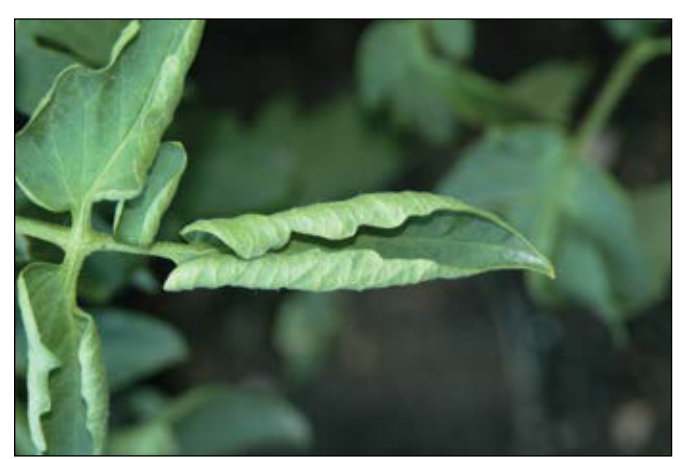
Figure 9. Physiological leaf roll.